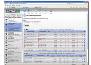
Fuel & Emissions Report