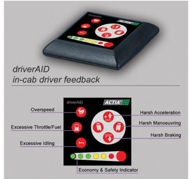
driverAID in-cab driver feedback

In addition to its Economy & Safety Indicator, driverAID gives the driver information on braking, acceleration, cornering, overspeed, fuel consumption and idle time, warning when he/she strays outside the fuel economy and safety range, and for what reason. In this way, the driver knows exactly where improvements need to be made.