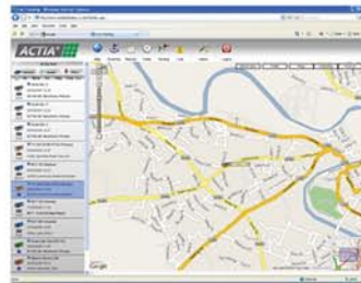
Live GPS Position