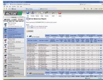
Driver Behaviour Report

Because all operators are not the same, a one-system-fits-all approach is not a solution. That's why Actia's local back-office resource offers fully customisable reporting and functionality to meet the individual operator's needs.