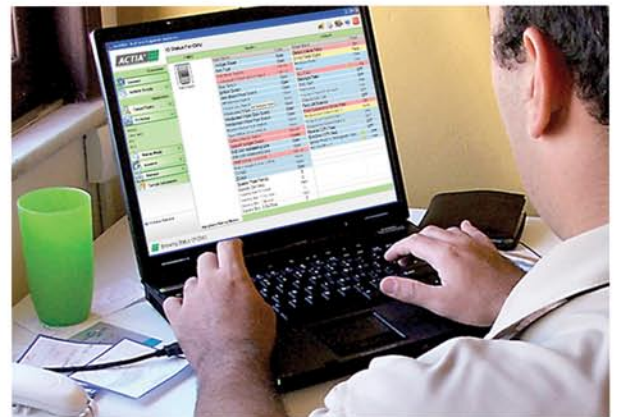
Full Remote Diagnostics*

Vehicle condition monitoring means improved workshop planning offering better vehicle turnaround and more time in service - optimising vehicle availability and fleet profitability.