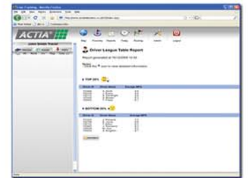
Driver League Table